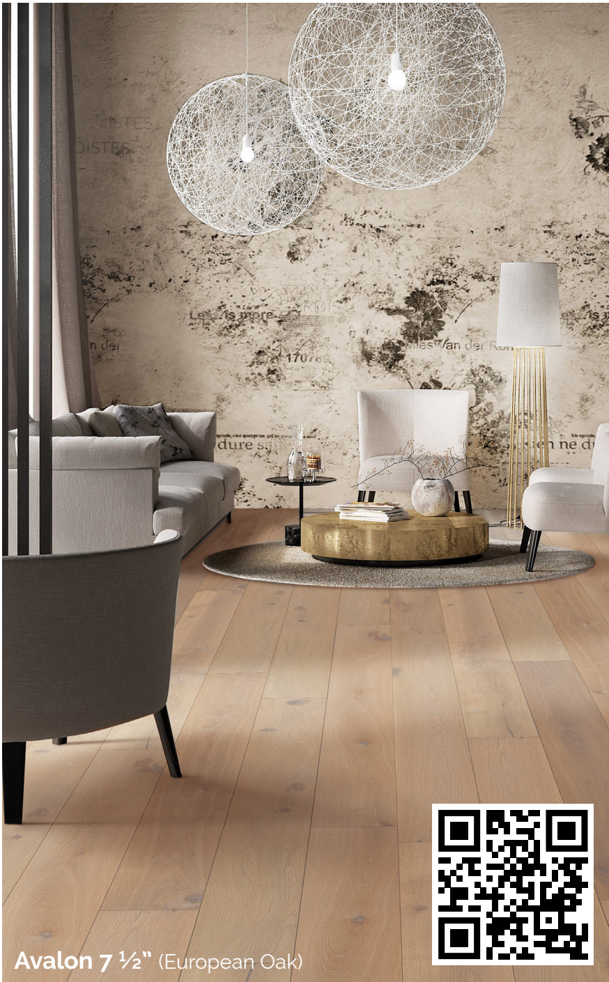
Avalon 7 1/2" (European Oak)